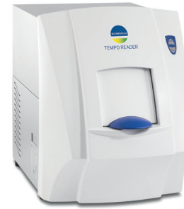
TEMPO CAM AOAC PTM 112002 Item# 421509