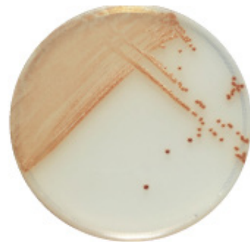
CAMPYFOOD Agar Method (CFA) AOAC PTM 071201 Item# 43471