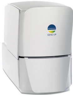
GENE-UP CAM AOAC PTM 012202 Item# IS1100