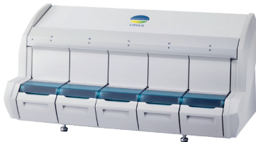
VIDAS CAM AOAC PTM 051201 Item# 30111

Developed specifically for the food industry, GENE-UP is a real-time PCR-based solution that delivers results in under an hour, and VIDAS is an automated immunoassay platform with an extremely simplified workflow providing next-day results.